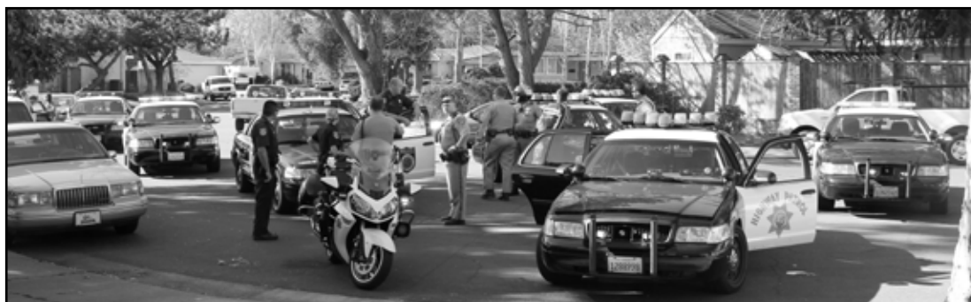
Left: The law enforcement response to Olivet Court