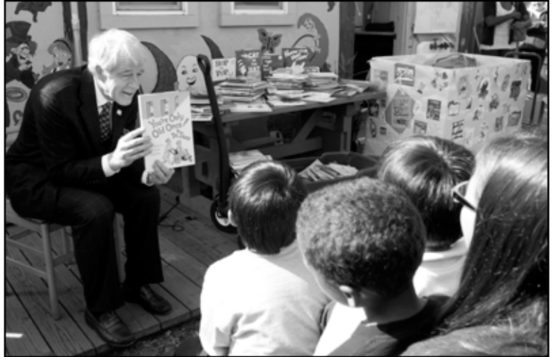
Assemblymember Roger Dickinson reading to children at his book drive distribution event March 5 at Mustard Seed School in Sacramento.

Shockingly, only one-third of all students entering high school in the U.S. are proficient in reading—15% African American students and 17% Hispanic students. Sadly, children who do not read are four times as likely to dropout